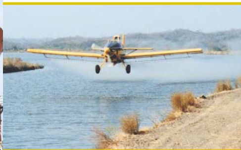
Another innovation: fertilizer and feed application by crop duster.