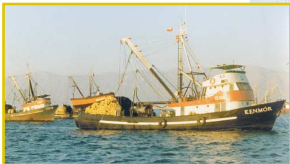
When his fishmeal business outgrew its boats, Morrison built larger ones.

The Morrisons recognized that specialized shrimp feed was critical to success. Imported feeds were scarce and expensive, and local feeds were mainly poultry diets that quickly disintegrated in water. So the brothers built Alimentos Balanceados Animales, the first dedicated shrimp feed mill in Ecuador. It, too, was followed by many other shrimp feed mills.